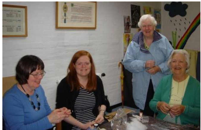
The first meeting of the Friendship Craft Group.