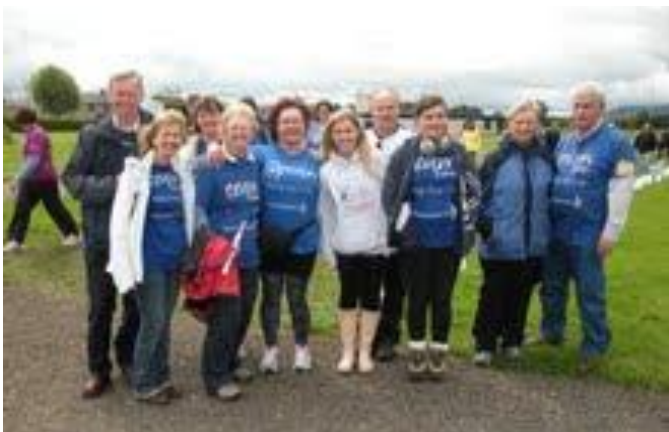
Some of the team at the end of the 24-hour relay

Sun.30 th September – Harvest Thanksgiving