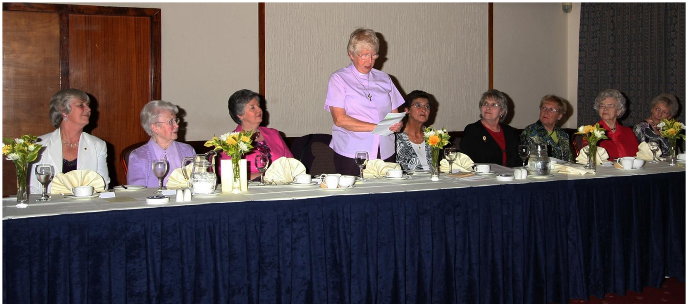
The top table at the Guild's 80 th Anniversary Celebration at Woodland House Hotel