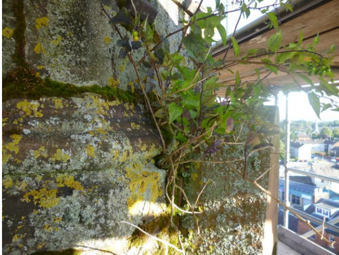
The greenery which was growing out of the spire