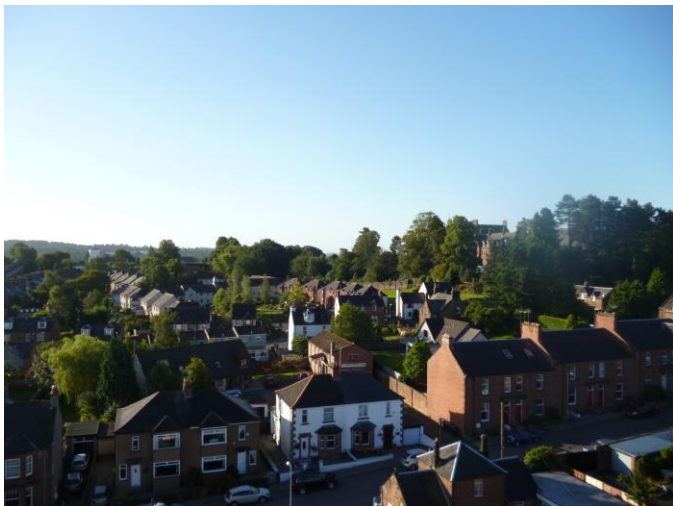
View towards the Convent