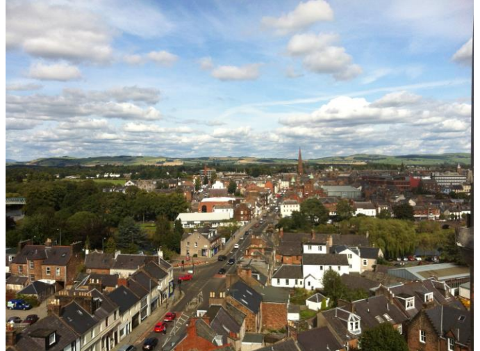
View from the top of the spire down Laurieknowe and Buccleuch Street