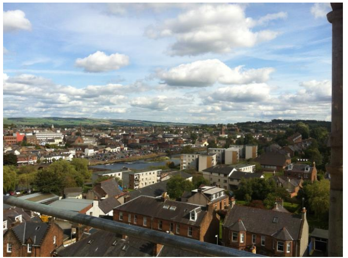
View over the River Nith