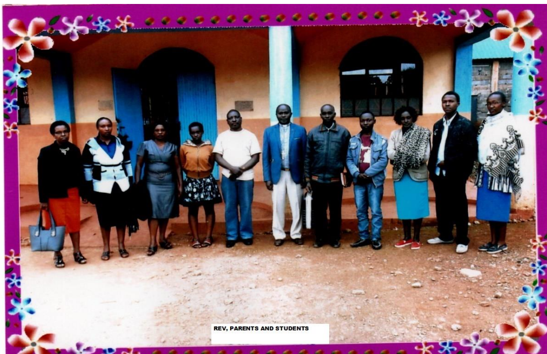
Mathia Students after their Bursary Presentation

If you would like to take a vacant date or help to arrange church flowers, please contact AD