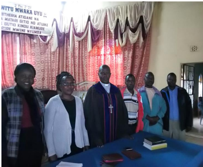
Presentation to Mathia Students