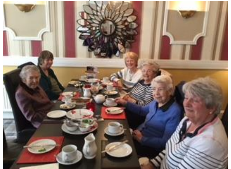
Parish Visitors' Group Tea